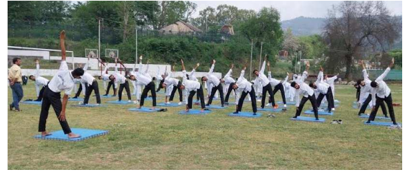
THE KASHMIR TALK BUREAU POONCH:

Under the Fit India Initiative, the Department of Physical Education and Sports, SCS Govt. Degree College Mendhar, organized a Yoga and Badminton events on 10th April 2025 to promote health, fitness, and well-being among students.