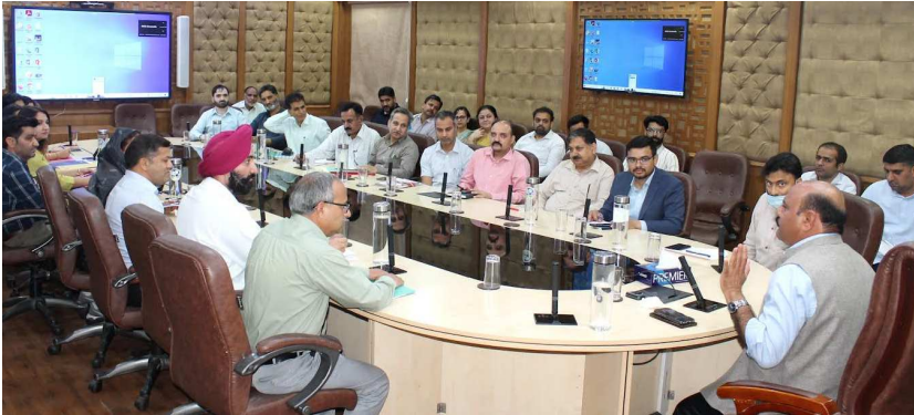
THE KASHMIR TALK BUREAU JAMMU:

Reviews functioning of Labour and Employment department