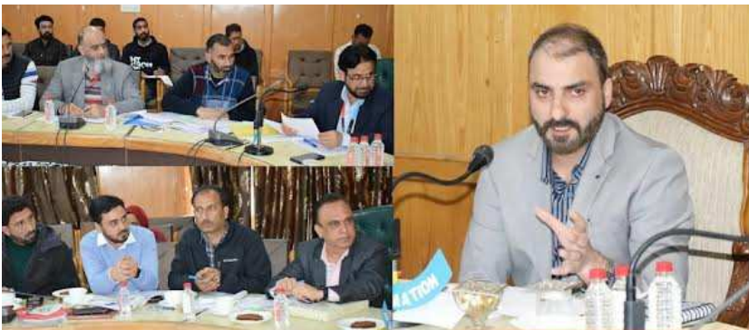
THE KASHMIR TALK BUREAU PULWAMA:

Focus on financial inclusion and infrastructure expansion