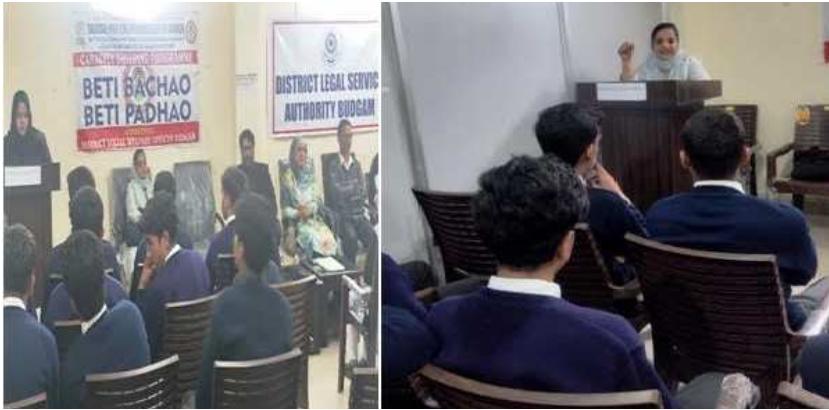
THE KASHMIR TALK BUREAU BUDGAM:

In a significant move, District Legal Services Authority (DLSA) Budgam in collaboration with Juvenile Justice Board, Budgam organized an awareness programme for Legal Services Unit for Children (LSUC), Support for Admission/Re-admission in Schools at Juvenile Justice Board Budgam.