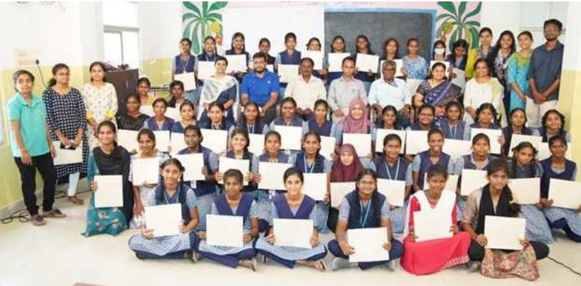
THE KASHMIR TALK BUREAU JAMMU:

Bhumi, one of India's leading non-profit organizations dedicated to youth empowerment and social change, has partnered with realme, the most popular smartphone brand among Indian youth, to expand its impact through a range of educational and community development programs. As a brand that understands the aspirations of young India, realme has always stood at the intersection of innovation and impact. Through this collaboration, realme aims to empower more young individuals by providing them with the right skills, resources, and opportunities to shape a brighter, more promising future.