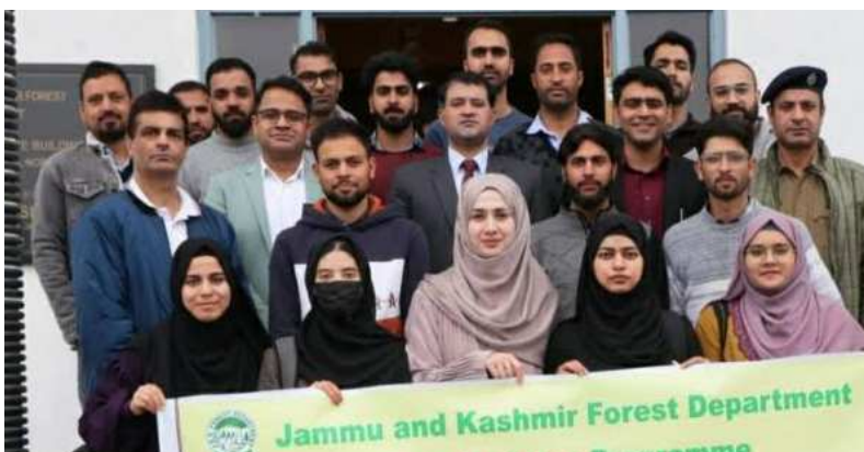
THE KASHMIR TALK BUREAU SRINAGAR:

In continuation to its efforts aimed at capacity building of Forest