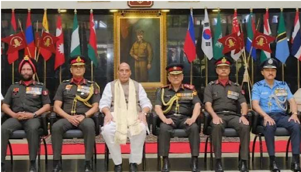
THE KASHMIR TALK BUREAU NEW DELHI:

Defence Minister Rajnath Singh Thursday stated that the world is in the age of Grey Zone and Hybrid warfare where cyber-attacks, disinformation campaigns, and economic warfare have become tools that can achieve politico-military aims without a single shot being fired. Urging the