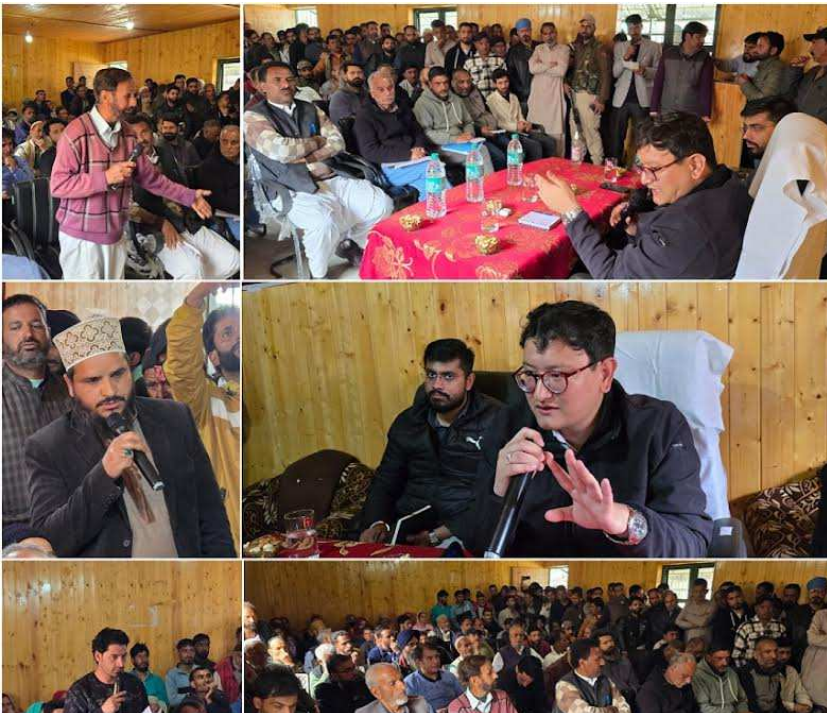
THE KASHMIR TALK BUREAU BARAMULLA:

People raise key developmental issues; DC Baramulla issues on-spot directions