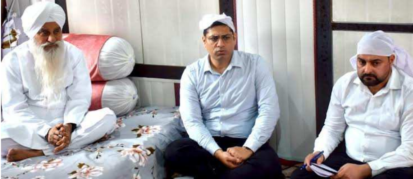
THE KASHMIR TALK BUREAU POONCH:

Ensures adequate Facilities, Security Measures for Annual Celebration